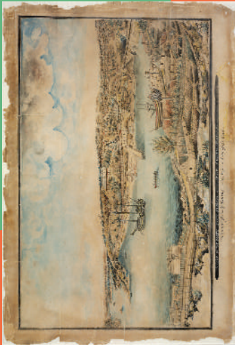
First Fleet

On 3 February, 1788, Richard Johnson, Chaplain with the First Fleet, gathered all those who were willing under a great gum tree and read the first Scripture lesson from a large leather-bound King James Bible. This Bible now rests in St Philip's York St Anglican Church in Sydney.