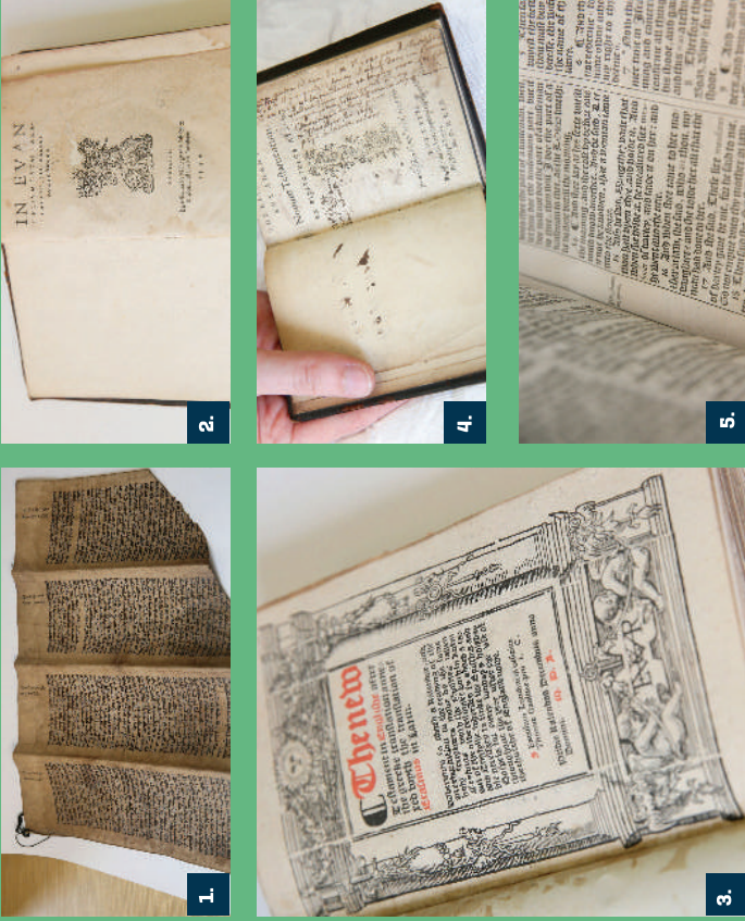
1. Hebrew scroll fragment. 2. Gospel of Luke in Latin. 3. A 1550 Tyndale New Testament. 4. Greek New Testament from 1568. 5. First Edition of the King James Bible. Images and information courtesy of www.treasures.more.edu.au and www.abc.net.au/diogen

Parts of that library survive today, in the possession of Moore Theological College: