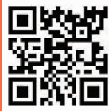
Quire 200c, pp13-14

On 7 February, 1788, Arthur Phillip was sworn in over the Bible. As the first Governor of the colony, he delivered a speech to the convicts, advising them to embrace the Christian virtues of marriage and put an end to promiscuity.